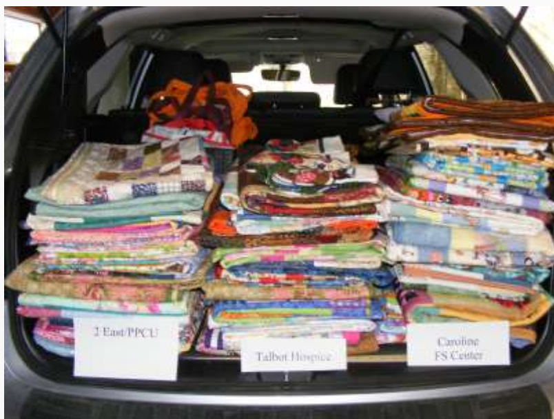
January's donations to UMSRH - 2 East/Pain Palliative Care, Talbot Hospice, Caroline Family Support Center. 1/31/21

Since September 1, and as of January 31, 2021 Outreach has been given, made and distributed 903 items to the residents of Talbot County and Caroline Family Support Center (216). That's in only 5 months! For those of us who like statistics, that's 158 quilts, 2 pillowcases, 52 bibs, 1 receiving blanket, 14 hats, 4 pillows, 413 Christmas stockings, 1 afghan, 90 children's scarves, 1 Singer Serger to Talbot 4-H, 1 baby sweater set, 1 patriotic quilt kit to a Hospice volunteer, 158 stuffed toys, 2 books, 4 kitchen towels, American Doll Swing set. Plus 2 bags of yarn for a non-member to make children's/baby's hats. Chapel District