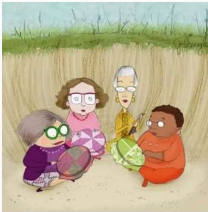
Stich in the Ditch Club