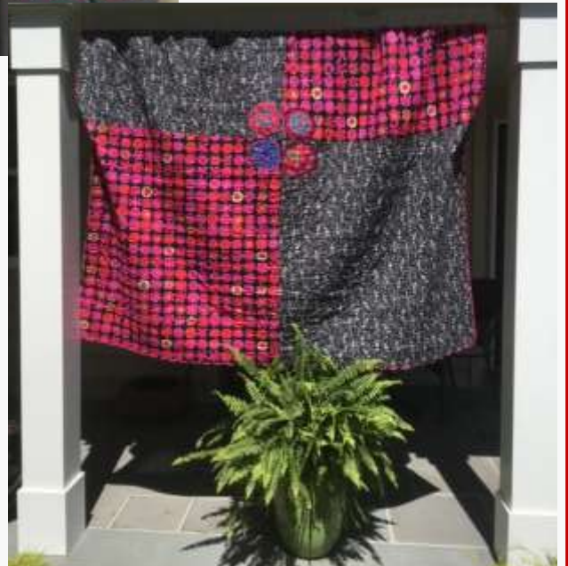
...and her Bubbles quilt left.