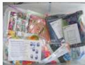
All kinds of kits