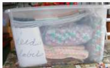
Hand work: Bindings