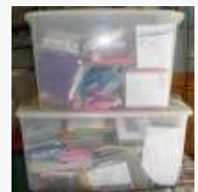
More FQ kits