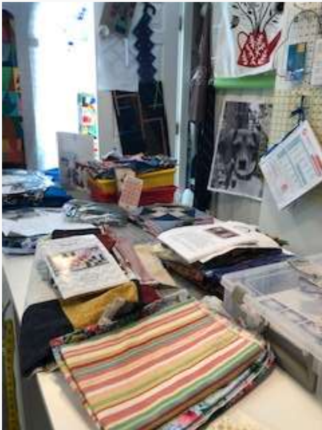
Nita Brayton says there are 10 UFOs in this picture!!! Good Grief!!!