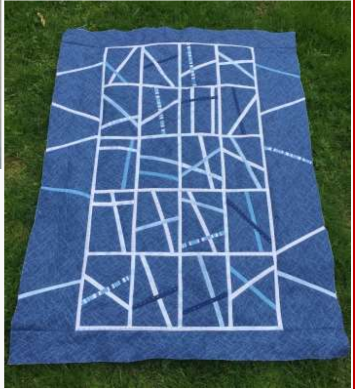
Lou Diefenderfer's Pick Up Sticks from Bonnie Dwer's Class