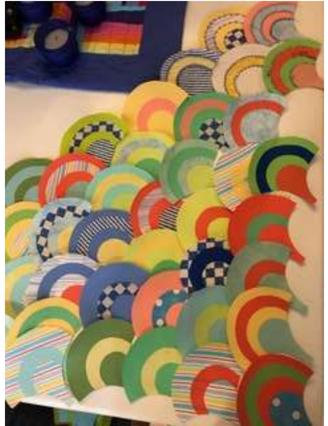
Here is a picture of cut and glued clams that I am preparing for a quilt or wall hanging. The top right 5 show some stitching of decorative stitches. Now I need to stitch all the rest for the quilt and attach the clams to a backing..