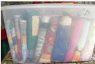
Hand work: Labels

Outreach still has items to be made or finished!