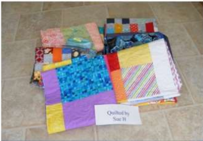
Quilted by Sue H