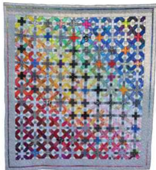
Color Me Happy Raffle Quilt 2024 Quilt Size 83" x 90"

The Rhapsody of Color Quilt Show hours are Thursday and Friday, May 2nd and 3rd from 10:00 a.m. to 6:00 p.m. and Saturday May 4th from 10:00 a.m. to 4:00 p.m. Adult admission is $10.00, which covers entry for all three days and children 10 and under are free.