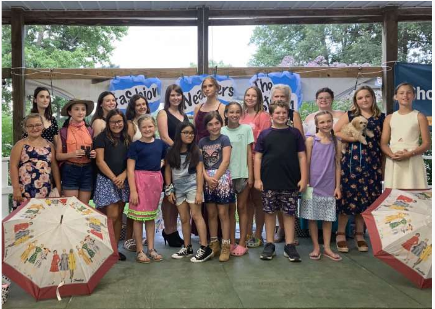
Fashion Revue 2021 Talbot County Fair