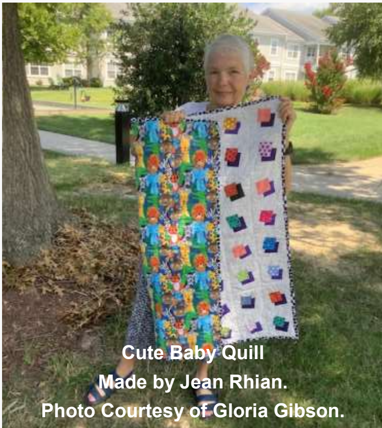
Cute Baby Quill