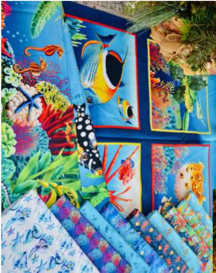
Coral Reef - Digital designed by Lori Anzalone