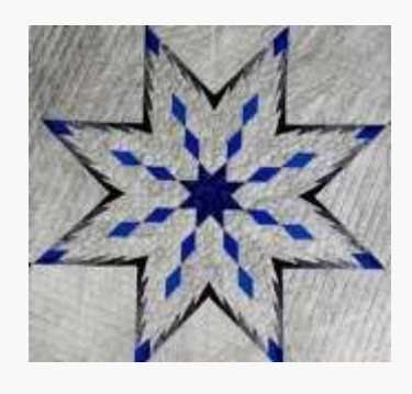
Variation of Sand Dollar The eight large diamonds are rotated 180 degree.