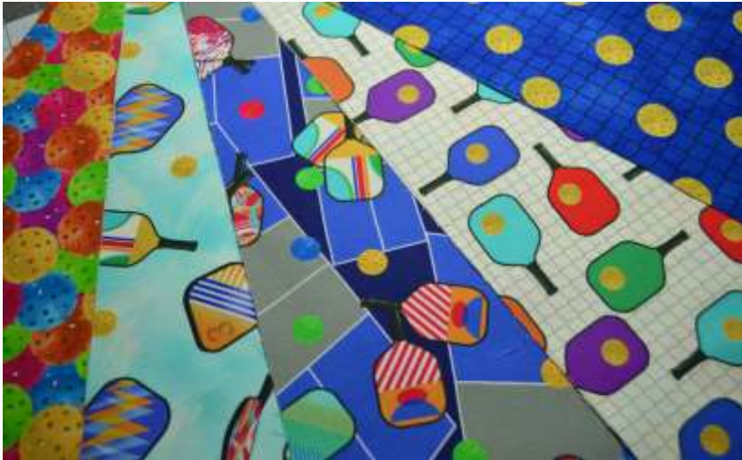
Pickleball Anyone? From Blank Quilting Corp 1/2 yard of 5 designs