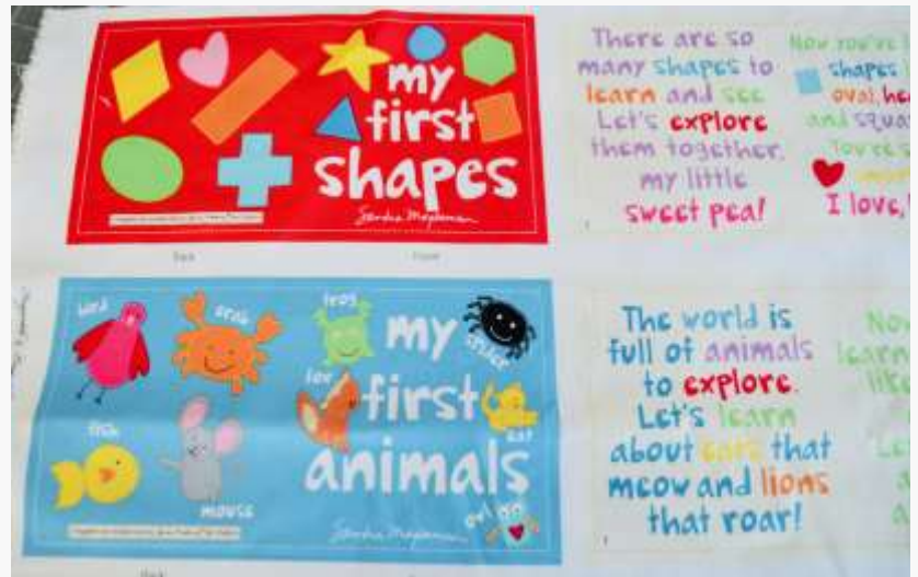
Huggable and Loveable XIII Designed by Sandra Magsamen For Studio E Fabrics 2 panels. Each panel has [3] 5"x5" soft books