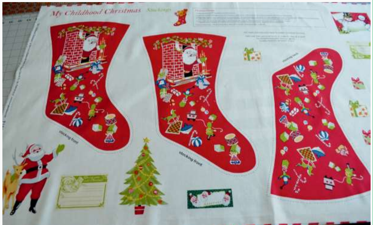
Set of 2 Christmas Stockings [with how to sew instructions] plus assorted fabric gift tags