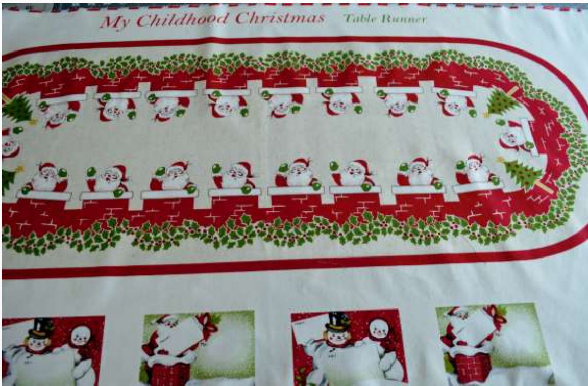
24" Oval Table Runner with assorted fabric gift tags