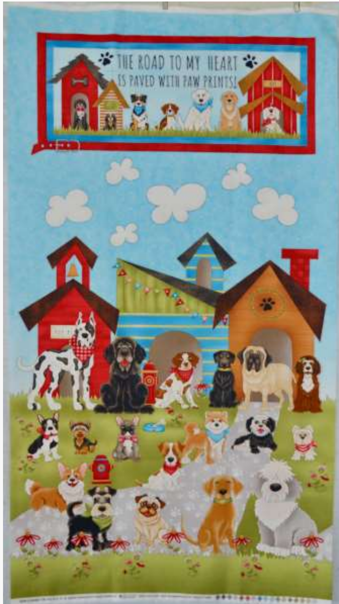
Home is Where the Dog Is II Banner Panel

Everyone donating to Outreach will get entered into the drawing for these prizes.