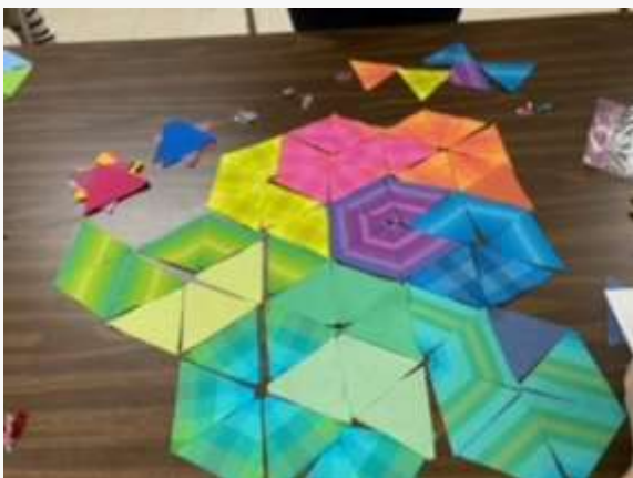
Kin West sees stars. Then we played with triangles.