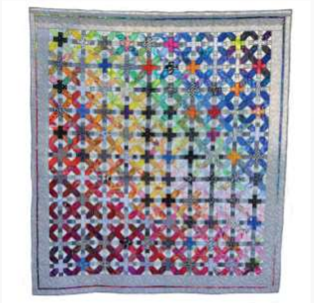
Color Me Happy Raffle Quilt 2024 Quilt Size 83" x 90"

The Rhapsody of Color Quilt Show hours are Thursday and Friday, May 2nd and 3rd from 10:00 a.m. to 6:00 p.m. and Saturday May 4th from 10:00 a.m. to 4:00 p.m. Adult admission is $10.00, which covers entry for all three days and children 10 and under are free.