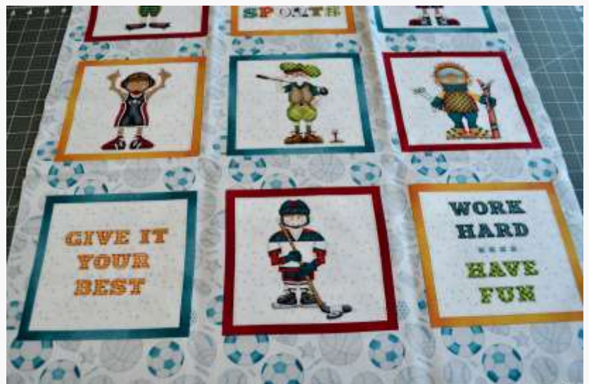
"I Love Sports" from Henry Glass Fabrics