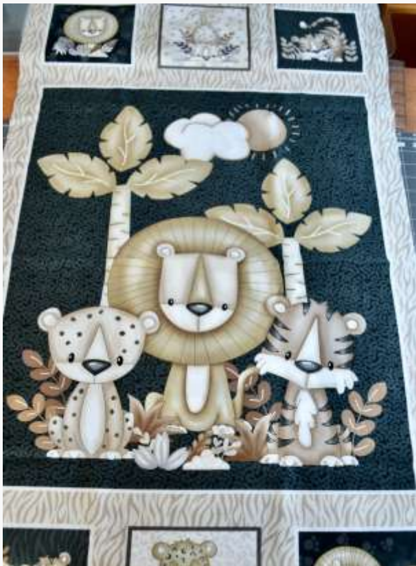
"Big Kitties" from Henry Glass Fabrics