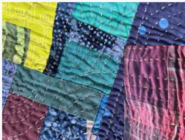
Kin West Big Stitch