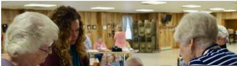
Flanged Binding Demo