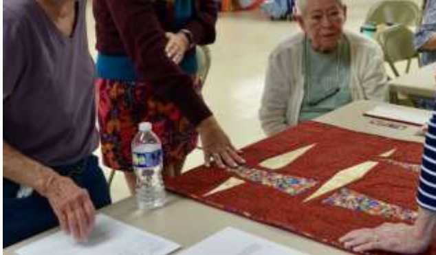
Prairie Point Binding Demo