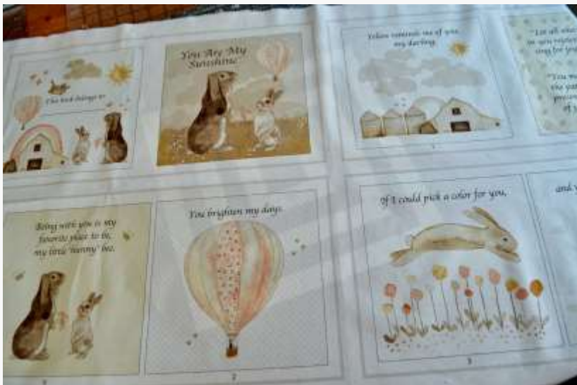
"You Are My Sunshine" soft book panel from Henry Glass & Co.