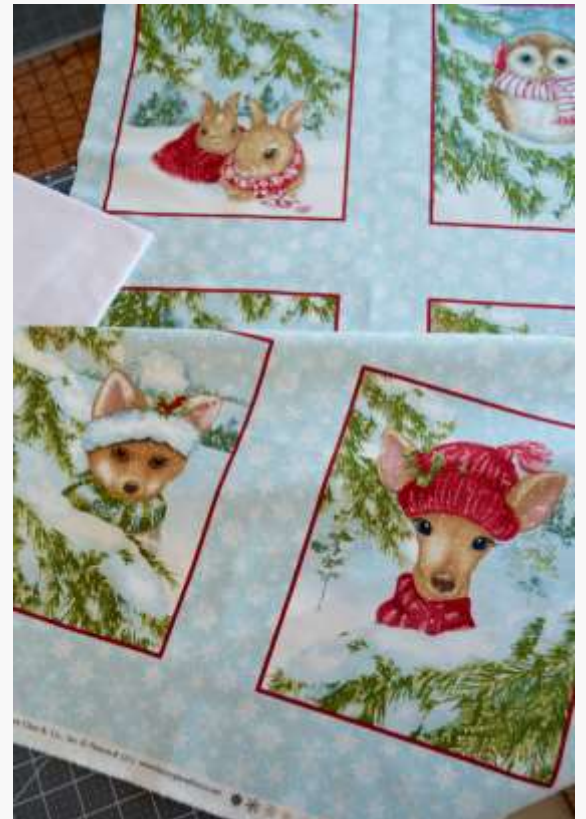
"Magical Menagerie" panel from Henry Glass & Co.