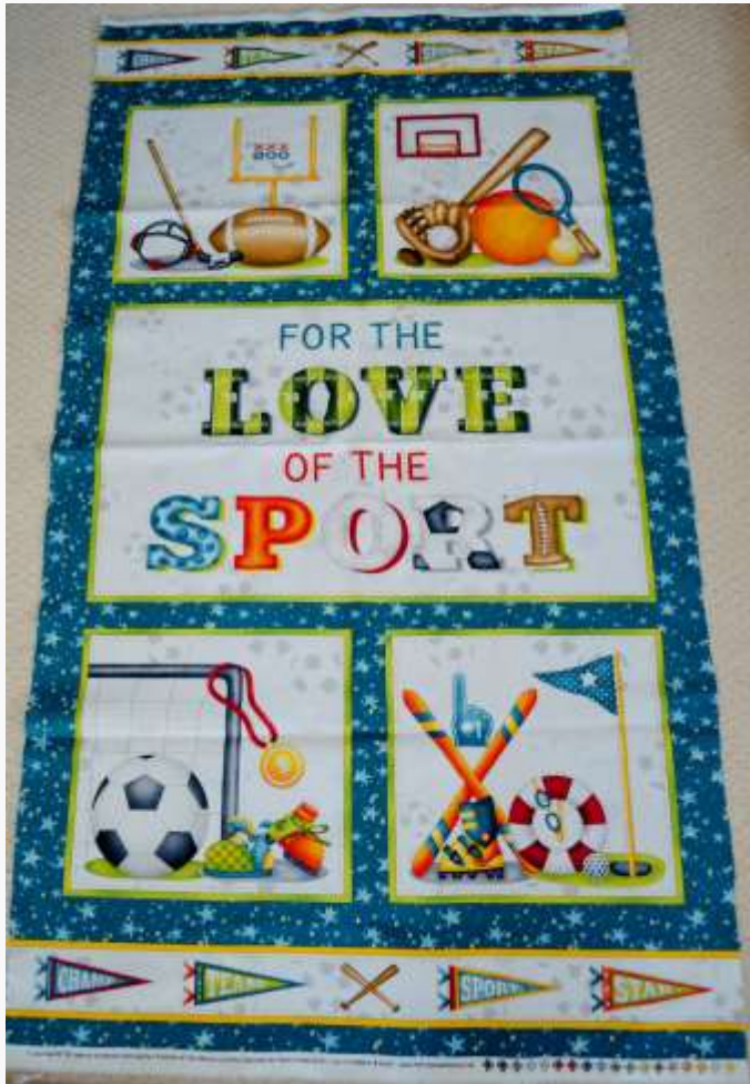
"I Love Sports" panel from Henry Glass Fabrics