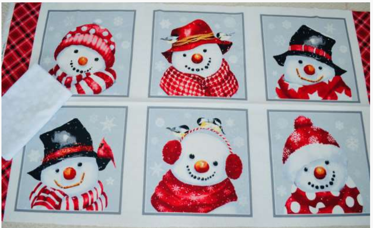
"Snow Crew" panel + 1 yard of white on white snowflake fabric from Henry Glass Fabrics