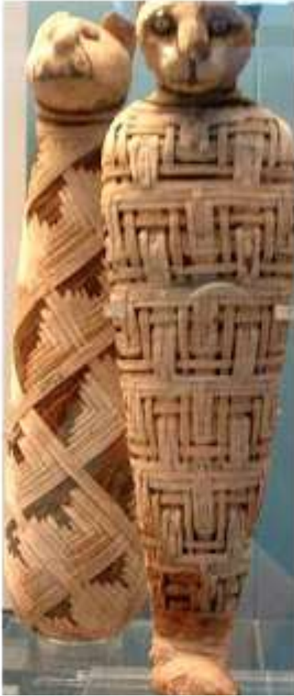
Display of Egyptian cat mummies at the British Museum.

"It's hard to know what 19th century people named their quilts. So few written records mention a quilt by name. Fair records, for example, listed numerous prize winners with generic names like "silk quilt", "patch-work quilt cover," and "cradle quilts." But we are lucky here because we do see fair records mentioning the "log quilt" pattern, also called "log cabin". The pattern was so popular in the 1870-1900 period that fairs opened categories specifically for log cabin quilts.