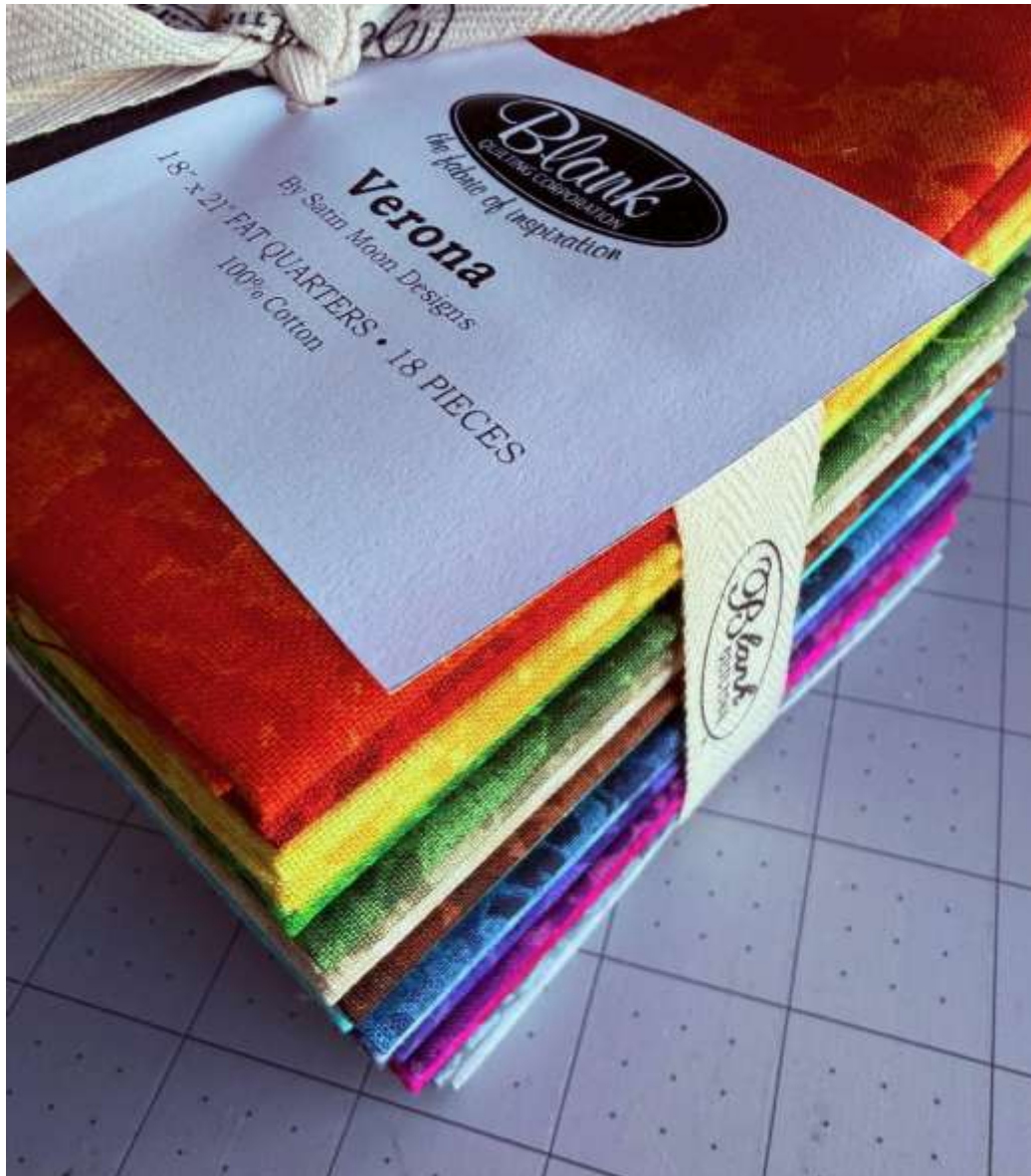
Verona from Blank Quilting [1] 18 piece fat quarter bundle